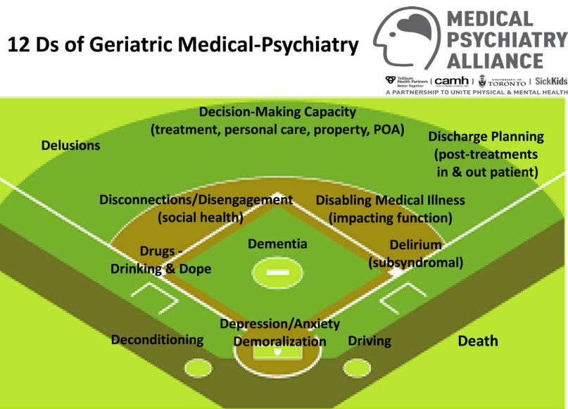
Figure 1. Schematic of the 12 Ds of Geriatric Medical-Psychiatry presented like a team of players on a baseball field to facilitate easier recall of the clinical concepts.

organized, and holistic format to discuss the pertinent issues facing geriatric patients.